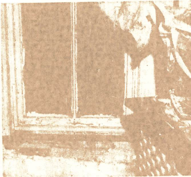
SLUMS: This is one of the apartments at 137 East 114th Street, a tenement owned by Robert Bernard. The picture was shown in evidence at the owner's trial. He was fined $500 for Health Code violations and ordered to clean up the violations by March 15 or go to jail for thirty days.

who es at 6 treet, he Brown zed the building hs and had to the case. The case. The God case. The God case. The God