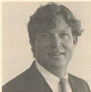
Ted Kennedy, Jr.

In 1973, newspaper headlines across the country informed the nation that 12-year-old Ted Kennedy, Jr. had lost one of his legs to bone cancer. More than two decades later, this cancer survivor is a symbol of courage, devoting much of his life