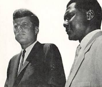
Senator Kennedy confers with African leader Tom Mboya