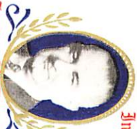
Lyndon B. Johnson PRESIDENT