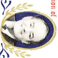
Hubert H. Humphrey VICE PRESIDENT