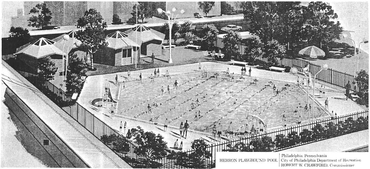
HERRON PLAYGROUND POOL